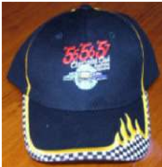
Club Cap $20.00