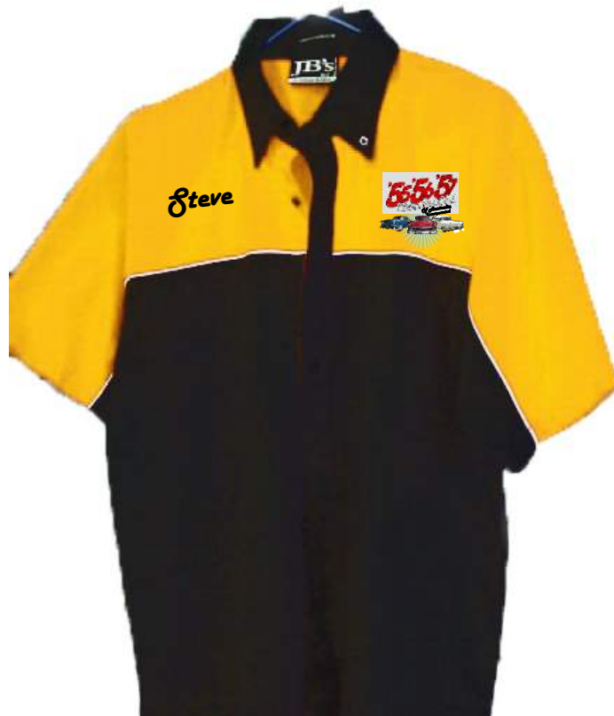
Bowling style shirts Mens Shirt $45.00